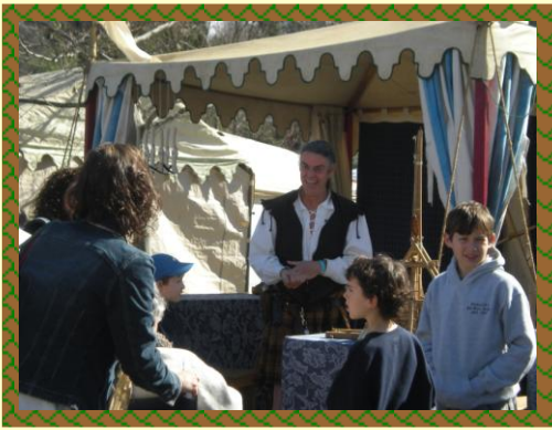
Living History Village Celtic History Walk Through Time